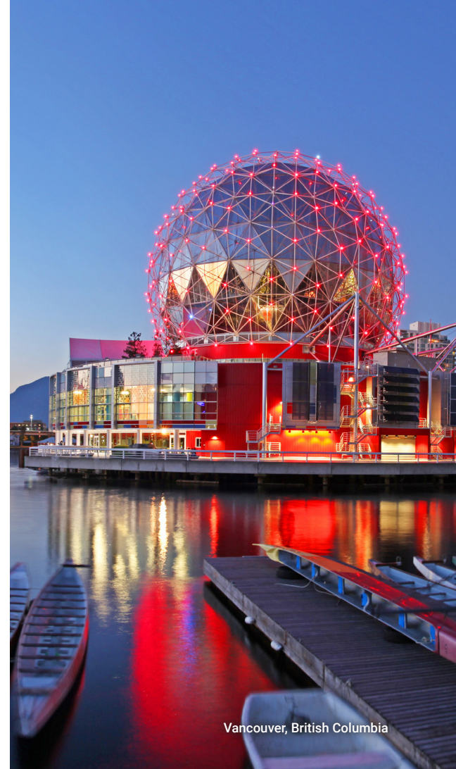
Vancouver, British Columbia