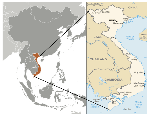
(U.S. Central Intelligence Agency)