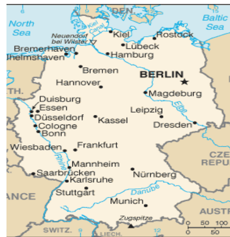
(U.S. Central Intelligence Agency)