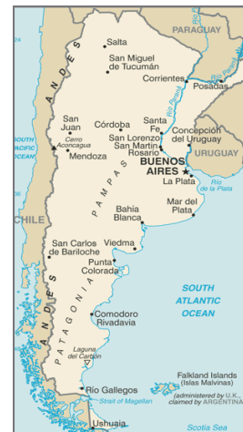
(U.S. Central Intelligence Agency)